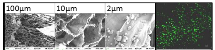
Fig 2: Structure and biocompatibility: scanning electron micrographs of porous miRaColl & live/dead staining of stem cells (MSCs) after 1 week.